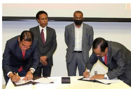
Signing of Technical Cooperation between TradInvest Timor-Leste & Customs Authority on 17 Sept, 2020