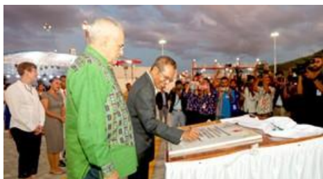
Inauguration of Tibar Bay Port on 30 Nov, 2022 by H.E President of TL and H.E Prime Minister of TL