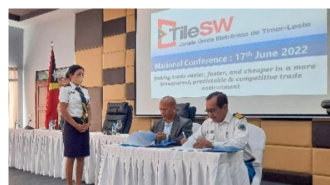
Signing of Technical Cooperation DNTT & Customs Authority on 17 June, 2022