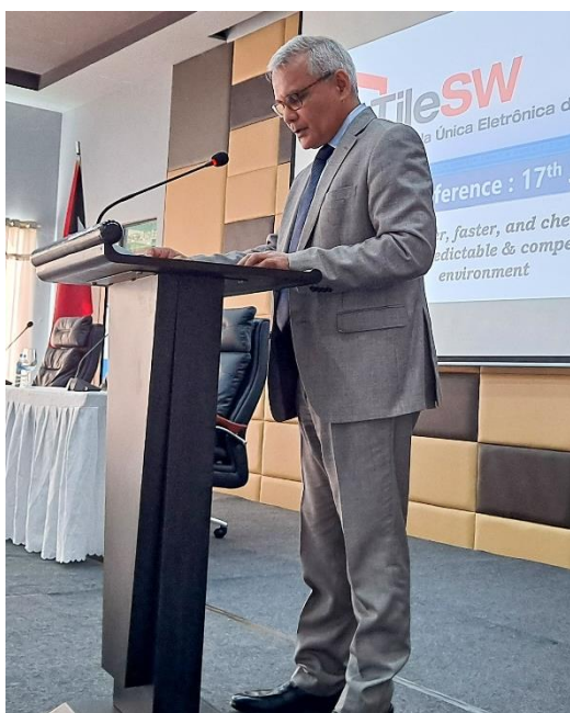
Minister of Finance H.E Rui Augusto Gomes Delivering a speech during the National Conference on TileSW

On 17 June 2022, the National Conference on Timor-Leste Electronic Single Window was held in City8 hotel, Has Laran, Manleuana, Dili. The conference enjoyed the presence of the Minister of Finance, Vice-President of Commission D of the National Parliament, Vice-Minister of Finance, UN Resident Coordinator, UNCTAD/ASYCUDA Regional Coordinator for Asia, Customs Commissioner, Representative of RAOEA president, Diplomatic Corps, Development Partners, and Government Agencies. The theme of the conference and workshop was "Making trade easier, faster, and cheaper in a more transparent, predictable & competitive trade environment" .