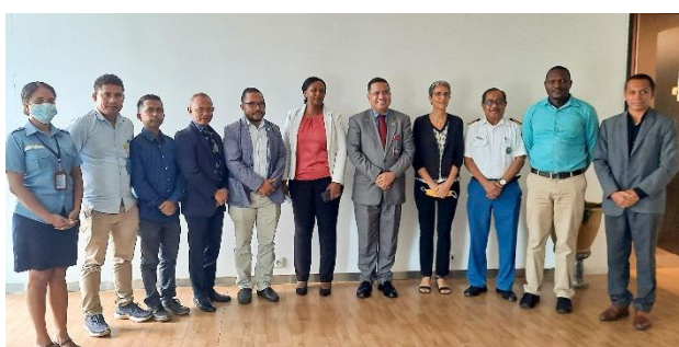
Vice Minister of Finance H.E Antonio Freitas chaired the 6th PSC meeting for the Timor-Leste Electronic Single Window (TileSW) project

The TileSW project convenes the Project Steering Committee (PSC) meeting on a quarterly basis. PSC is a 'high-level' committee that provides continuing oversight, policy guidance, coordination, and conflict resolution on behalf of the Government of Timor-Leste during the project implementation phases to ensure the successful implementation of the National Single Window in Timor-Leste. Hence, on Thursday, 16 June 2022, the Vice Minister of Finance, H.E. Antonio Freitas chaired the sixth Project Steering Committee (PSC) meeting for the Timor-Leste Electronic Single Window System powered by UNCTAD ASYCUDA that was held in level 10 of the Ministry of Finance office.