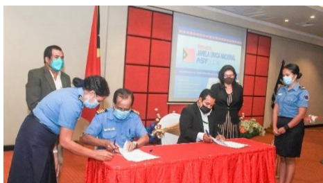
Signing of Technical Cooperation between National Ozone Unit & Customs Authority on 30 Sept, 2021