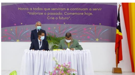
Signing of Technical Cooperation between SAMES, I.P & Customs Authority on 27 Nov. 2021