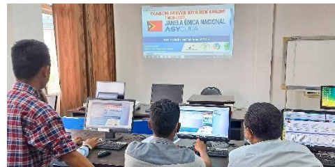
Training of Ministry of Health staff on Import clearance process for Medicine and Medical equipment