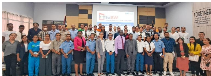
The Workshop on Timor-Leste Electronic Single Window enjoyed the presence of the UNCTAD/ASYCUDA Regional Coordinator for Asia, Customs Commissioner, Traders, and Government Agencies.

During the workshop, Customs Authority presented the Customs clearance procedure which was followed by an interactive session of the questions and the answers. Stakeholders got the opportunity to raise queries regarding the clearance process and they got answers from the Customs Authority.