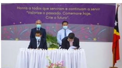
Signing of Technical Cooperation between National Directorate of External Trade & CA on 27 Sept, 2021